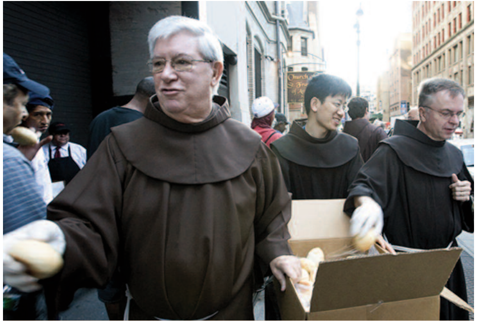
Friars at St. Francis of Assisi Church in Manhattan, as in many other areas of the East Coast, give food to the hungry.

Francis and his brothers abandoned all their possessions, rejecting life in a soci-